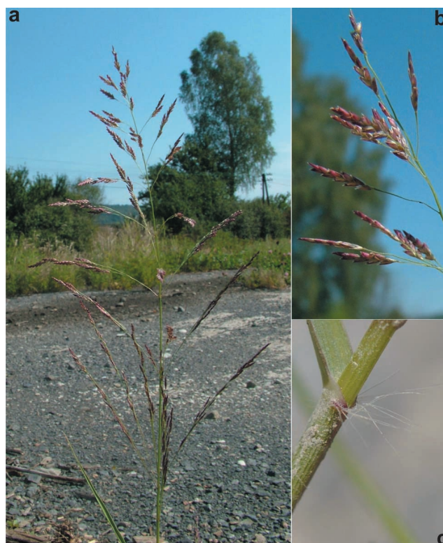
Fig. 1. Eragrostis pilosa in the reloading area by the railway station at Nowosielce

Until 2005, Eragrostis pilosa had been recognized as a holoagriophyte, spreading mainly on sandy alluvia in the Middle and Lower Vistula as well as the Lower San Valleys (Ceynowa-Giełdon 1973; Sudnik-Wójcikowska & Guzik 1996; Kucharczyk 2001). The plant was also reported on anthropogenic sites in Warsaw (Sudnik-Wójcikowska 1981; Sudnik-Wójcikowska & Guzik 1996), Szczecin (Holzfuss 1937; Ćwikliński 1970), Piła (Żukowski 1960), Dęblin (Głowacki 1975) and in the area of the Lubelskie province (Święś & Wrzesień 2002, 2003, 2004). Unfortunately, almost all these data were incorrect and the specimens collected in the territory of Poland, previously identified as E. pilosa , in fact belonged to E. albensis – the species described as new to science by Scholz (1996). What is more, in recent years, an intensive spreading of E. albensis in Poland has been observed (Michalewska & Nobis 2005; Guzik & Sudnik-Wójcikowska 2005; Wrzesień 2005, 2007;