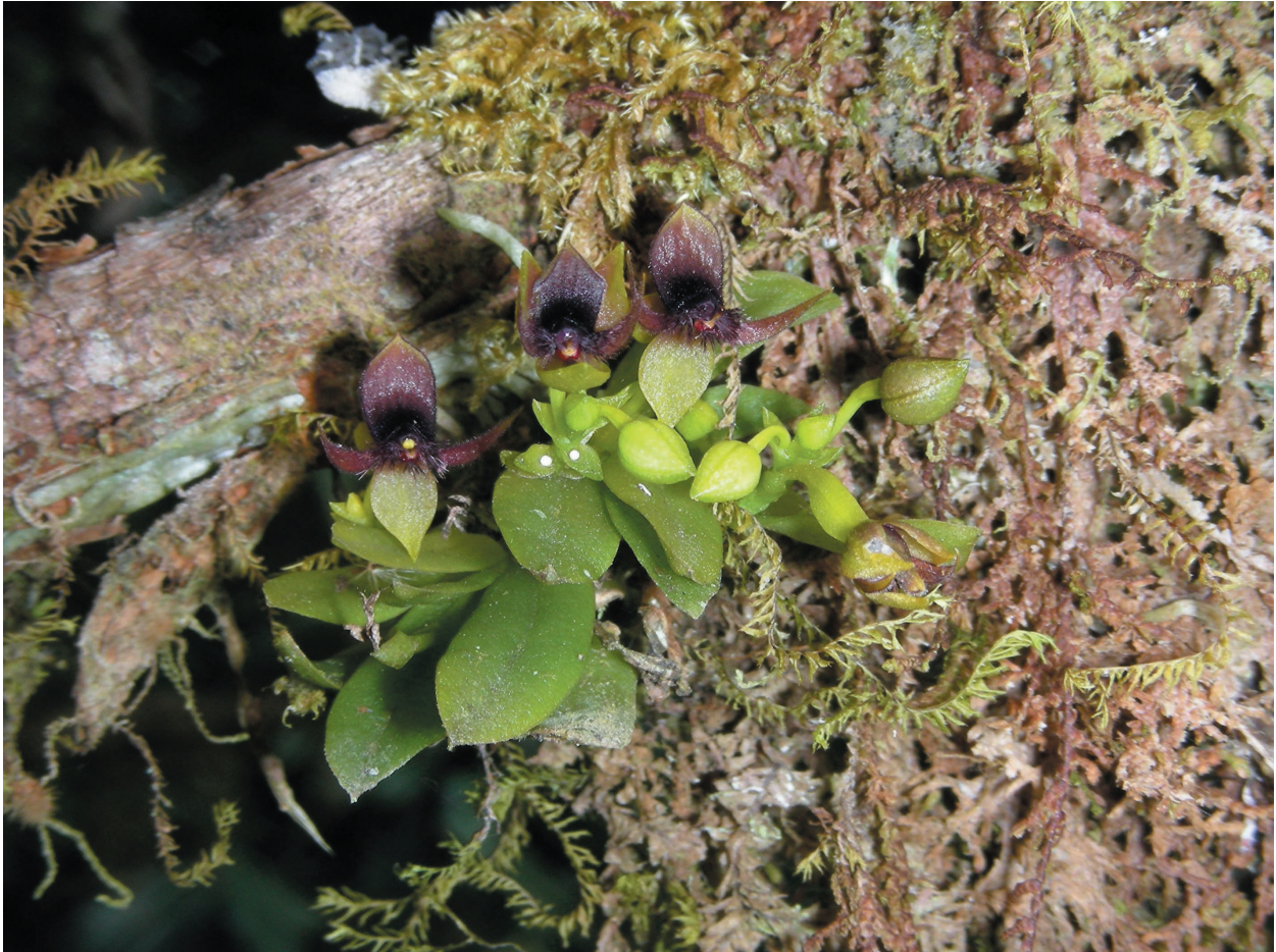
Fig. 1. Stellilabium kukwae – a habit