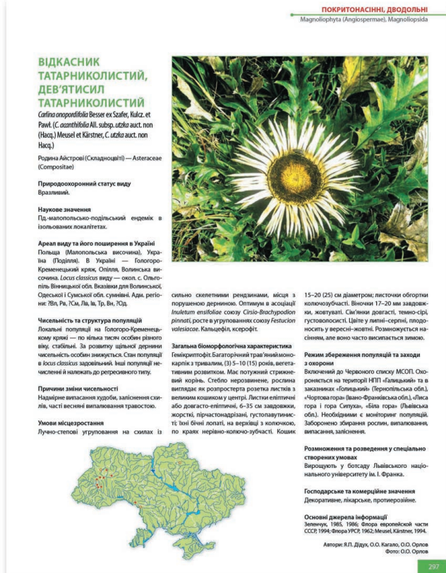
Fig. 3. The example – page from the Red Data Book of Ukraine – Carlina onopordiifolia

Although we could not avoid such declarative proposals as “monitor the status of populations”, “cultivate in botanical gardens”, or “do not violate habitats”, an effort was made to clarify and outline proposals for each species. For example, pasturing, tree felling, changes to the hydrological regime, artificial tree planting, plant collection and, for certain small local populations, even herbORIZATION should be restricted. In our view, this approach makes it possible to offer effective measures to preserve certain species. It is known that the protection regime adopted in reserves led to a size reduction or disappearance of populations for which these reserves were created. However, it is illogical to ban the collection of Pistacia mutica in the Crimea, Betula borysthena , Adonis vernalis or Trapa natans ,