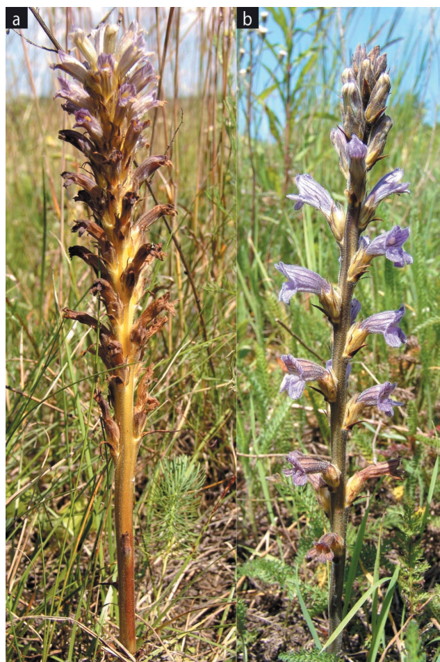
Fig. 1. Plant habit of (a) Orobanche bohemica (Zawiercie-Bzów, 11 July 2010) and (b) O. purpurea s.str. (Chrzanów, district Kąty, 18 June 2009)

A species morphologically similar to O. bohemica , and generally also to O. purpurea s. str., is O. arenaria . Like O. bohemica , it parasitizes Artemisia campestris and frequently prefers similar habitats. Both can be recorded in close proximity. Pubescence of the anthers is a good diagnostic character distinguishing the species even when dry. O. arenaria is distinguished by having