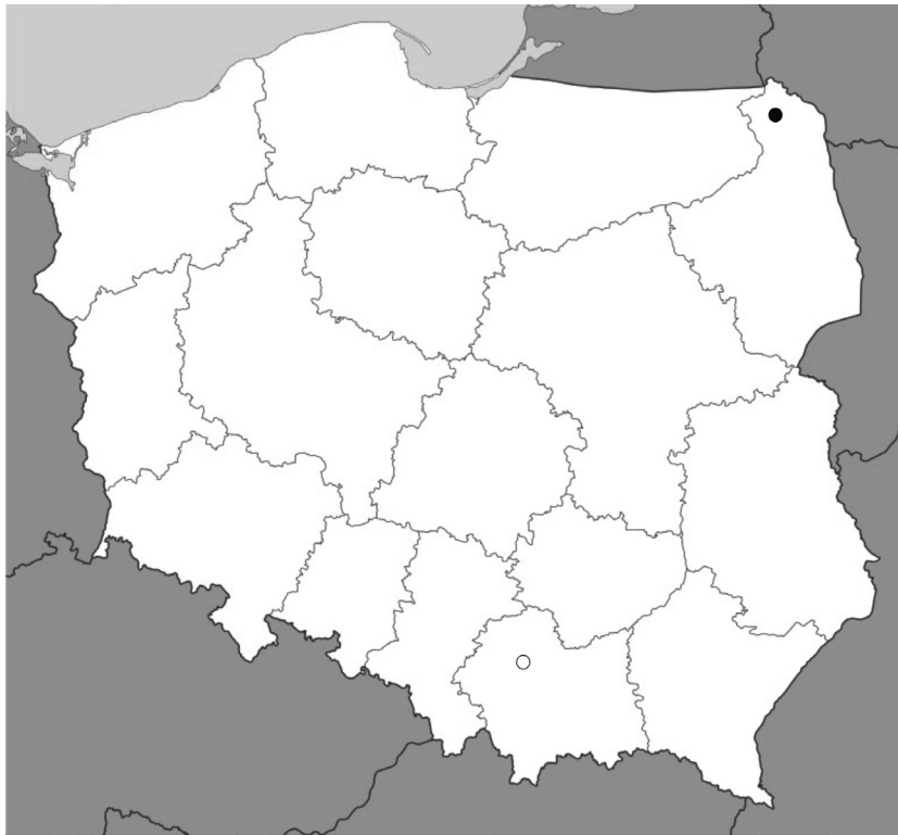
Fig. 1. Distribution of Badhamia versicolor in Poland (province boundaries indicated by grey lines) Explanations: ● – new locality, ○ – known locality